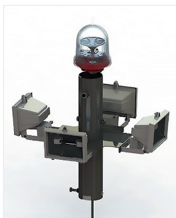
External Lighting + Obstacle Light