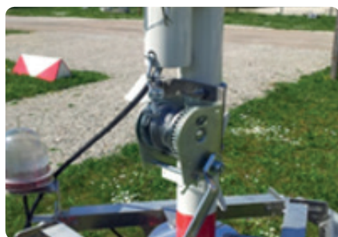
Hoist (in option)