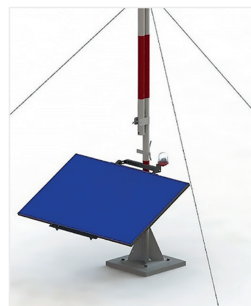
Solar power supply